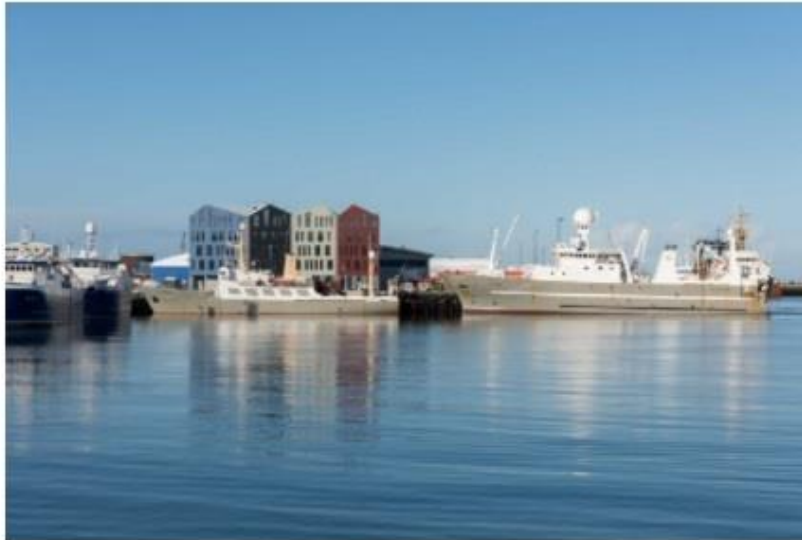
The Marine and Freshwater Research Institute.

icelandreview.com/business/mfri-advises-greatly-increased-capelin-catch-quota-for-2021-22/